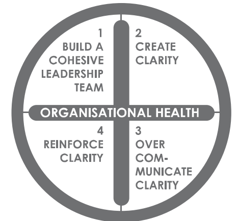
Patrick Lencioni 'The Four Disciplines of Leadership'

With renewed conviction, the team defined and adopted a simple set of ‘Vital Behaviours’ which guide and sustain the values that cement the team’s cohesion.